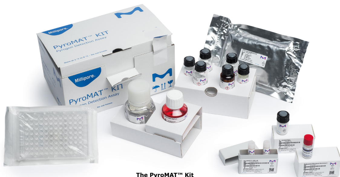
The PyroMAT™ Kit