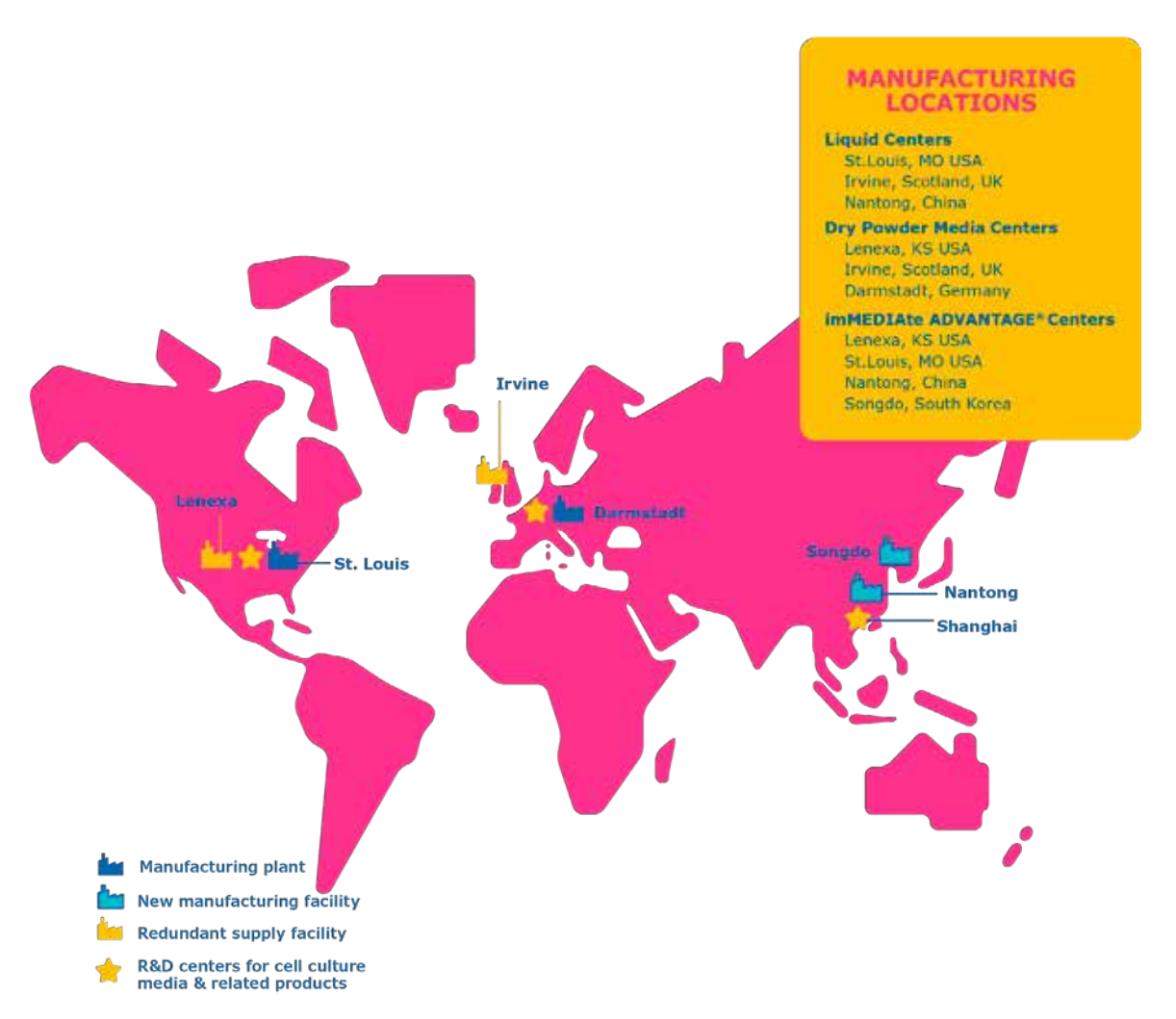
Figure 1. A manufacturing network with multiple sites for liquid and powder, all designed to deliver consistent quality product.