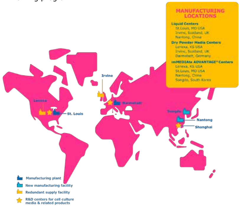
Figure 4. Our cell culture media manufacturing network

Each of our media facilities have on-site quality control laboratories. Standard quality control assays for media are conducted using harmonized current compendia methodologies. Other non-compendial assays require validation to ensure fit for use for cell culture media as shown in Table 1 .