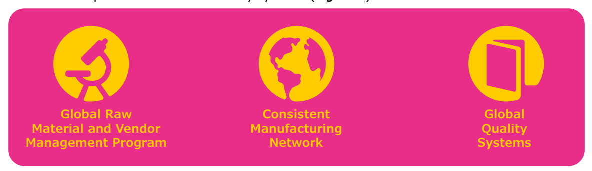
Figure 1. Our comprehensive cell culture media quality program is based on an integrated set of disciplines.

In this white paper, we highlight the breadth of programs implemented across our organization to safeguard the quality of the cell culture media that are used in our customer processes – from some of the world's highest grossing biologics to those produced on a patient-by-patient basis such as breakthrough cell therapies. Our programs represent a set of integrated disciplines focused on raw material characterization in conjunction with global supplier quality management and advanced procurement and inventory systems ( Figure 1 ).