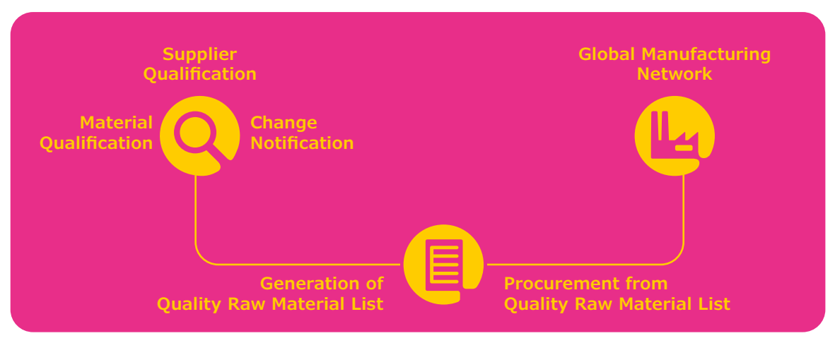
Figure 2 . Procurement and inventory systems are managed locally as part of our global, unified supply chain management program.

Supplier qualification includes a requirement for transparency regarding source of materials, the process used to manufacture the material as needed, the country of origin, complete documentation and proactive change notifications. Material qualification includes extensive characterization of a number of lots, and those attributes which would be a risk for cell culture media like trace element impurities. Local procurement teams and inventory systems are integrated on a global basis to help minimize the potential for supply disruptions and allow us to share batches for raw materials between sites.