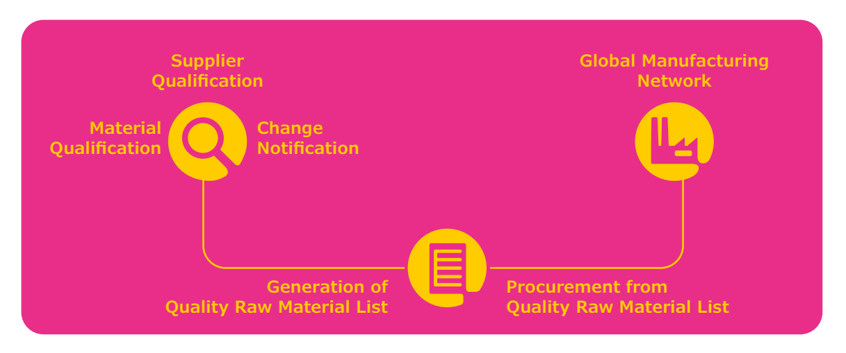
Figure 2. Our global raw materials vendor management program supports all of our manufacturing locations.

Our procurement experts purchase the same approved cell culture media raw materials, from the same qualified suppliers, for use at all our manufacturing sites. This gives you confidence that we're supplying high-quality products from any one of our manufacturing sites from all over the world.